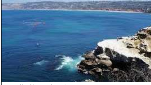
La Jolla Shores beach

would bring a cooler with drinks and water, and I would leave it by the Cove and start swimming between the Cove and the La Jolla Shores beach, about