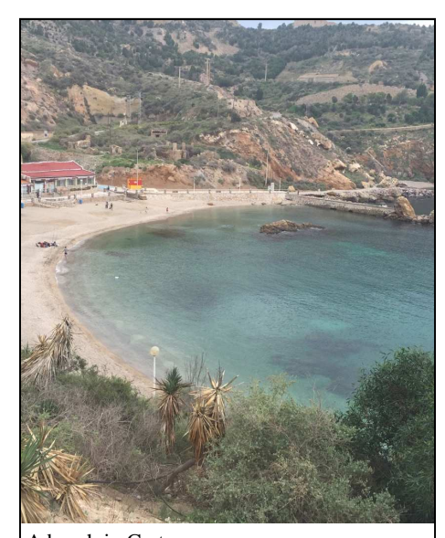
A beach in Cartagena

It was a two-way bike lane to the left of the traffic lane. The faintly marked bike lane I was riding in was the wrong one. Vale. I made it to class in plenty of time and informed the front desk that I was there for the free trial class and no hablo Espanol. I set up my mat, admired the studio with beautiful wood floors, a mirrored wall, and several photos of ancient yogis. I smiled politely as the various students come in and again explained that no hablo Espanol pero estoy aprendiendo. The instructor entered and to my delight he was a small 70-ish year old man with a long gray pony tail who clearly had studied under several master yogis. He found the music and to my surprise Katie Perry was blaring from the speakers, and we began our Zumbalike warmup!! WTF?? No intention to set? No Ujjayi breathing, just high kicks and craziness for 30 minutes. Yes, we did work up a sweat but not enough to require a shower! Nonetheless, we took a break. At first I thought it was a smoke