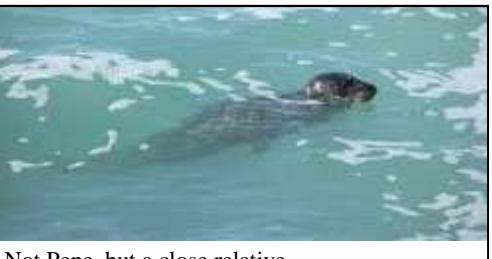
Not Pepe, but a close relative.

One day shortly after I arrived. about 500 yards from the shore where there was some pretty kelp floating and beautiful clown fish, this seal picked me up and