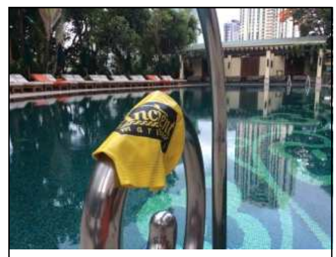
The Mandarin Oriental pool in Bangkok

The downside of travel is that it ruins your carefully crafted routines, like swimming schedules. So when I was packing for a three-week trip to Asia, I tossed in my suit, cap, and goggles, vowing to swim in every pool I encountered.